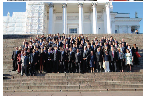
Thank you all for a really great CTIF event!